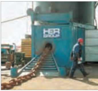
PE4004S pump and RD3006 cylinder used in a special press which repairs damaged chain links for the shipping industry.