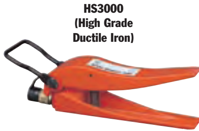
HS3000 (High Grade Ductile Iron)

Tested to conform to ASME B30.1 standard