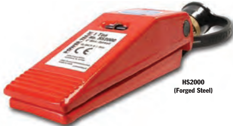
HS2000 (Forged Steel)