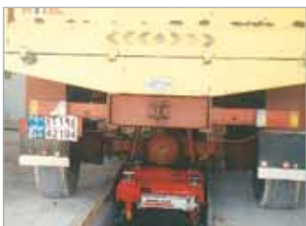
P300 hand pump and 10 ton cylinders used for a vehicle lift.