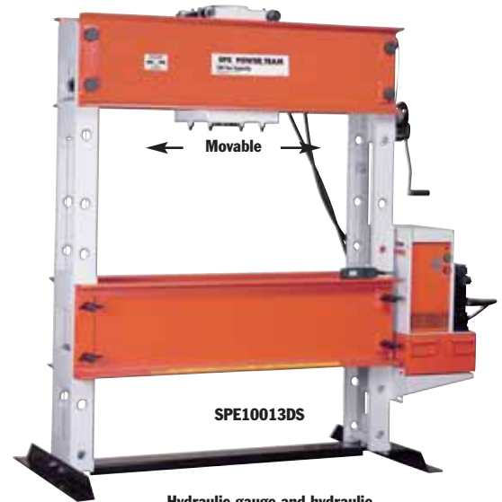
SPE10013DS Hydraulic gauge and hydraulic fittings are included with presses.