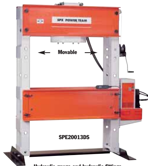
Hydraulic gauge and hydraulic fittings are included with presses.